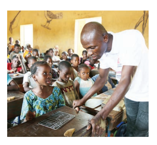
250 teachers and educational leaders were energized after pushing legislation that will protect children and learning during times of conflict.