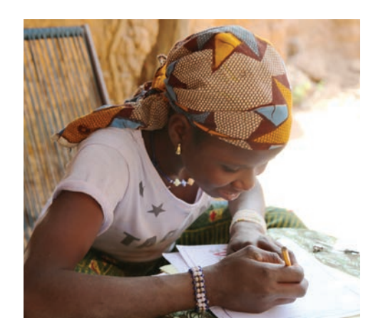
177 students completed and achieved high scores on their examinations after receiving educational support.

You made so much good possible last year. Here are a few more important results: