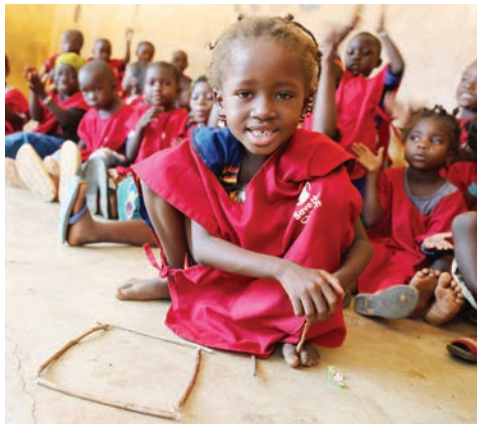
436 school-aged children have been able to safely return to school after schools were closed for security reasons.