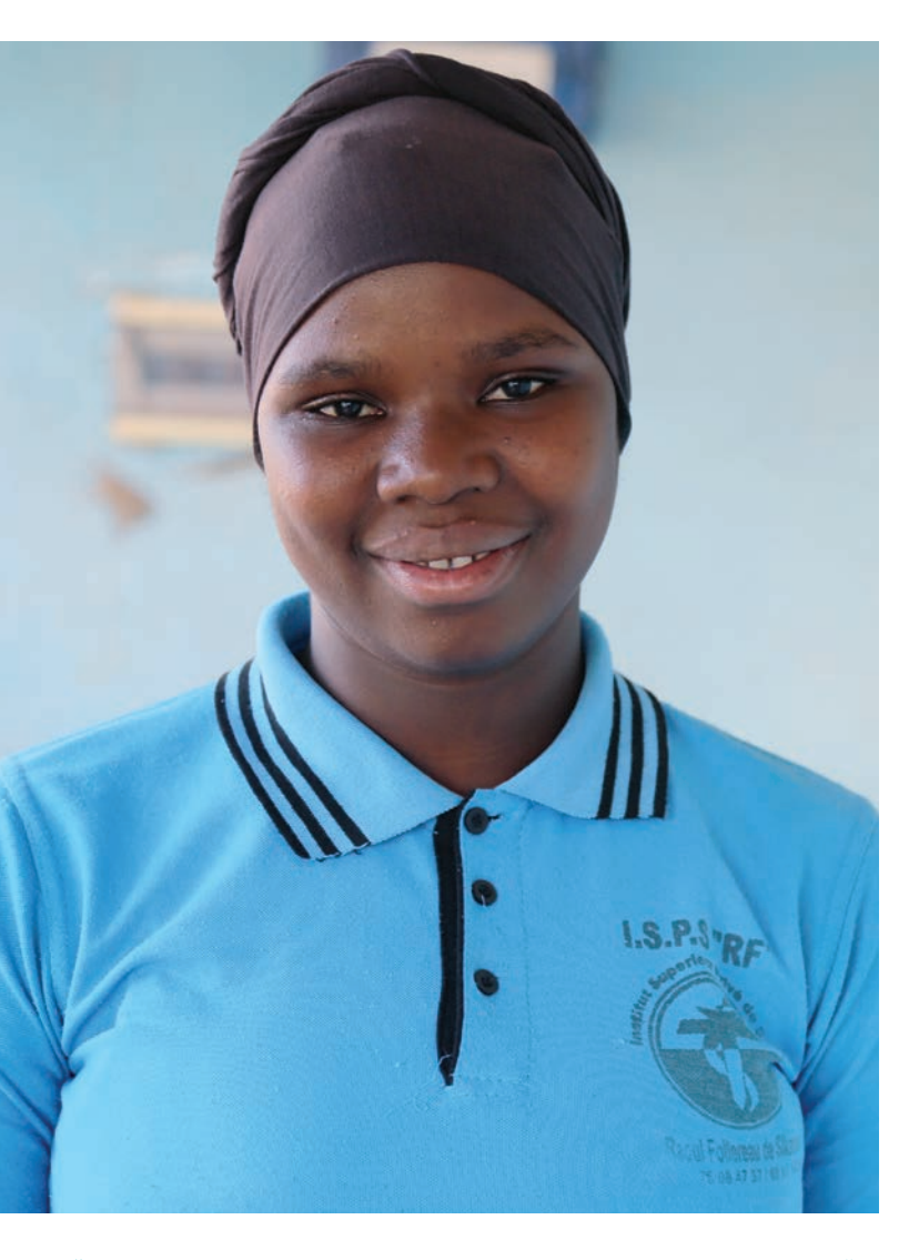
"Save the Children was such an encouragement to me."