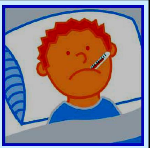
Stay home if you're sick