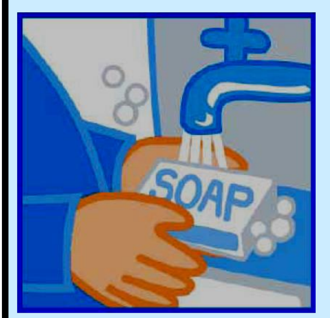
Wash your hands often with soap & water or use alcoholbased hand sanitizers