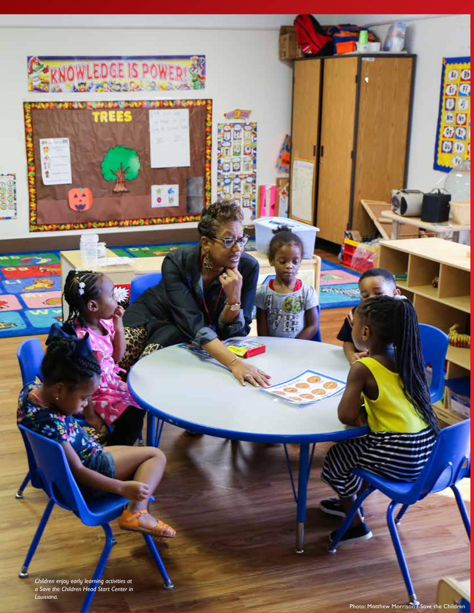
Children enjoy early learning activities at a Save the Children Head Start Center in Louisiana.