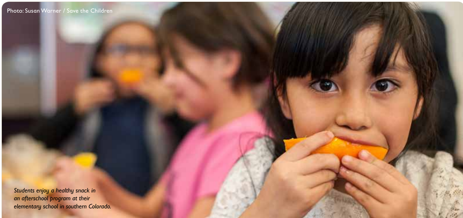
Students enjoy a healthy snack in an afterschool program at their elementary school in southern Colorado.