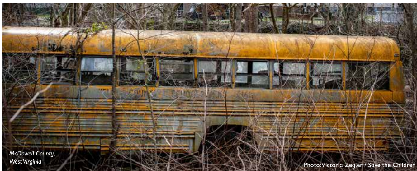
McDowell County, West Virginia