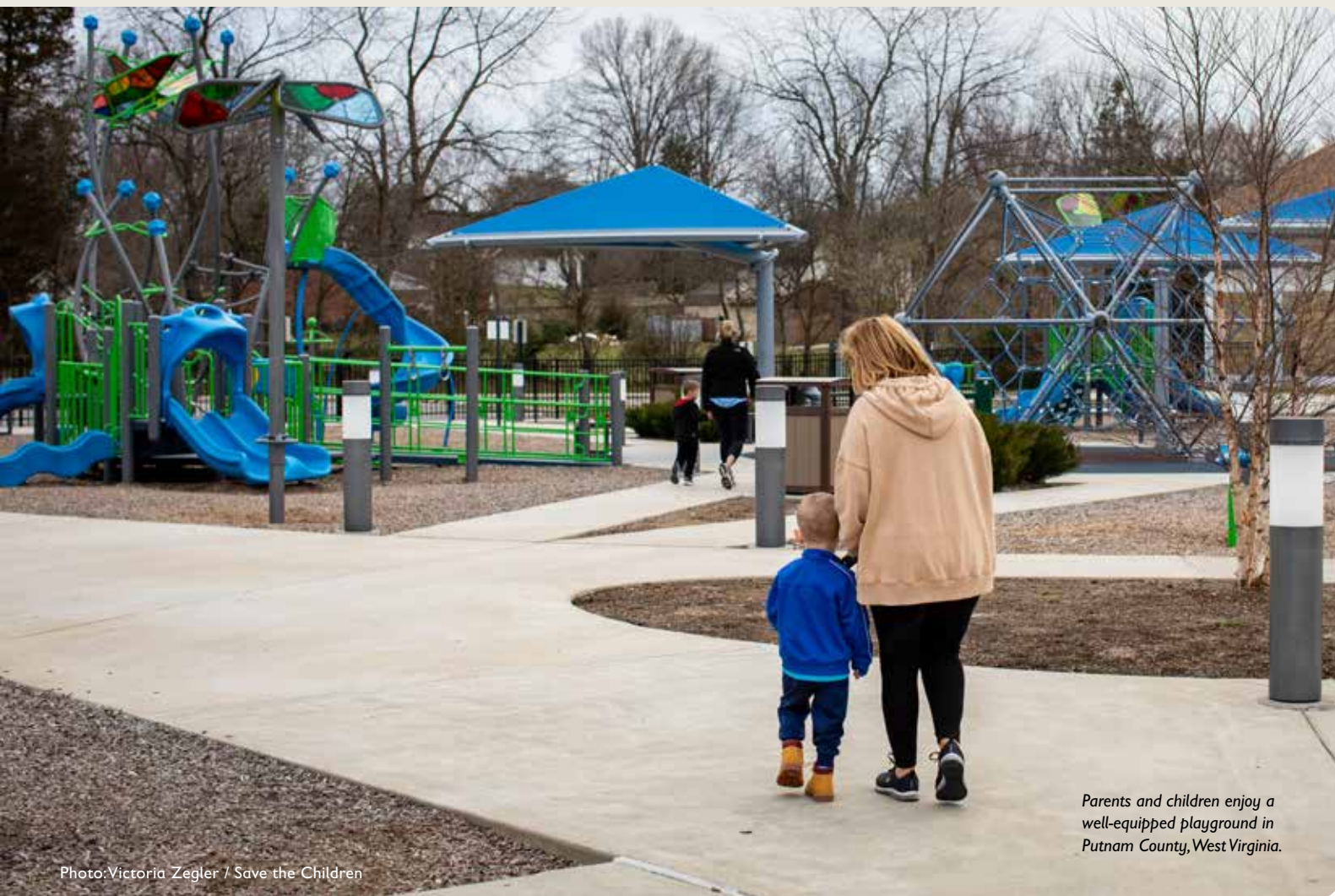
Parents and children enjoy a well-equipped playground in Putnam County, West Virginia.