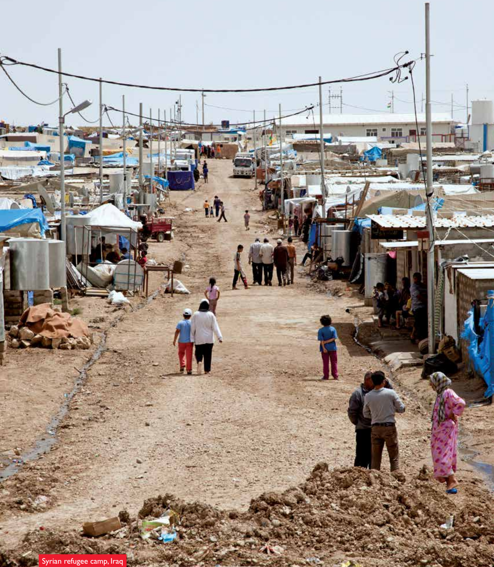
Syrian refugee camp, Iraq