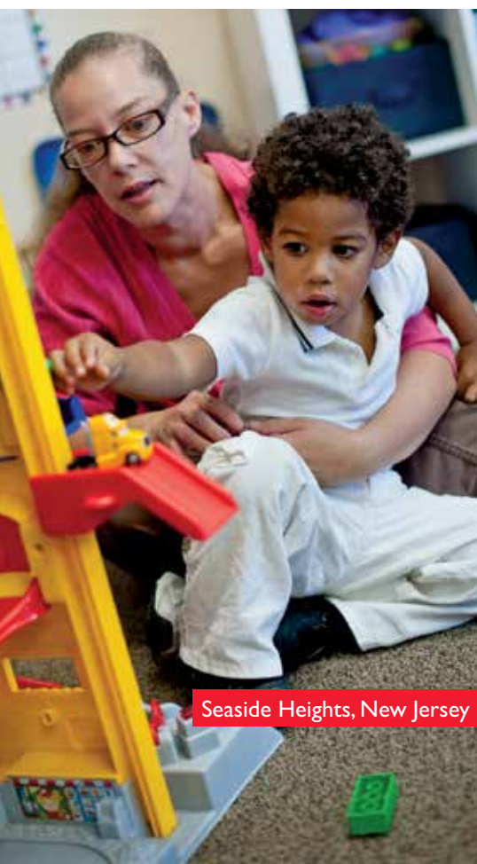
Seaside Heights, New Jersey

For my son, it messed up a lot. He wasn't able to play like he used to. He wasn't able to go to the park. He wasn't able to see the people he saw on a daily basis because we weren't able to go anywhere. We had to walk on the highway even to go to the nearest convenience store. So it stopped him from talking. It stopped him from wanting to feed himself and to play. He just pretty much stayed immobilized. [Now,] being around other children, just having a regular schedule, it's helped him a lot. He's starting to speak a little bit. He tries to explain more of what he wants. He doesn't have the tantrums he had before. He was doing at least 10 tantrums a day.... Having him here in the day care has helped me emotionally, because now I know my son is stable. My anxiety level is not so high anymore. I can breathe again.” 12