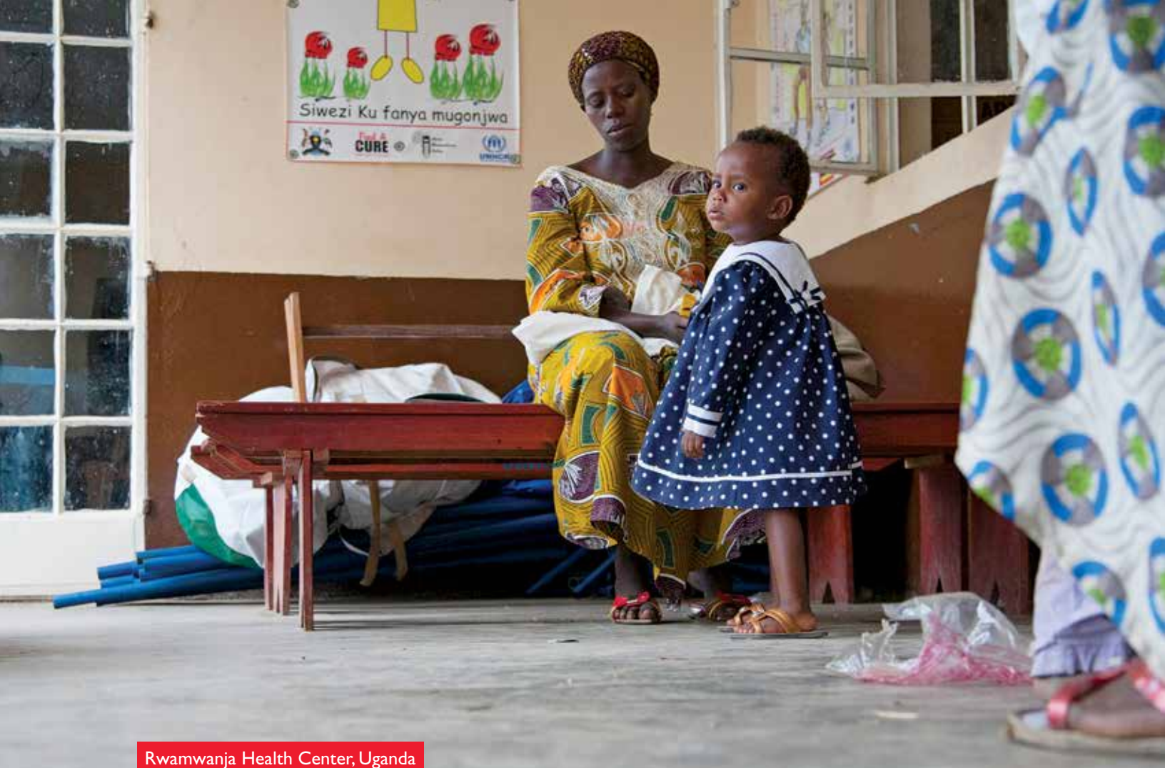
Rwamwanja Health Center, Uganda