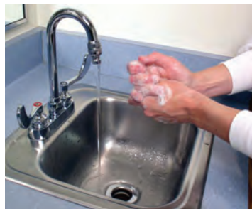
Additional photos: CDC/Kimberly Smith