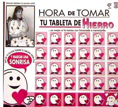
Figure 2: Example of Self-Praise Tool Used in Malawi Project.

Girls, you are beautiful & strong protect your future – REFUSE MEN!