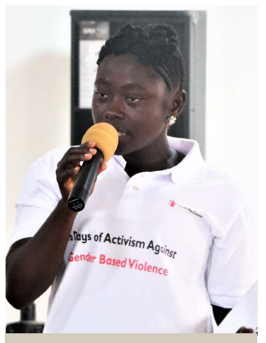
A Right to be a Girl-trained Girl Champion speaks in Pujehun on ending child marriage, 2021.