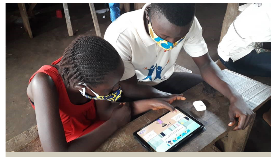
Adolescents using the SRH game app, 2020.

The project worked with adolescents from four urban areas of Freetown to design their own, locally and contextually relevant game application that provides accurate information to help adolescents and young people understand issues around puberty, teenage pregnancy, menstrual