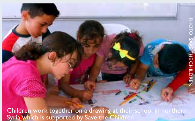
Children work together on a drawing at their school in northern Syria which is supported by Save the Children

Teachers support parents with home-based learning activities to continue their children's learning. Each teacher is responsible for around 30 children in their neighbourhood who they visit at least once a week. As children have their own textbooks, teachers help parents to set targets for what units should be covered by the child each week. They also ensure children have sufficient materials, check on the children's wellbeing and safety, and give parents advice and information to ensure they can effectively support their children's learning, thus ensuring a continuation of children's education and safeguarding their protection.