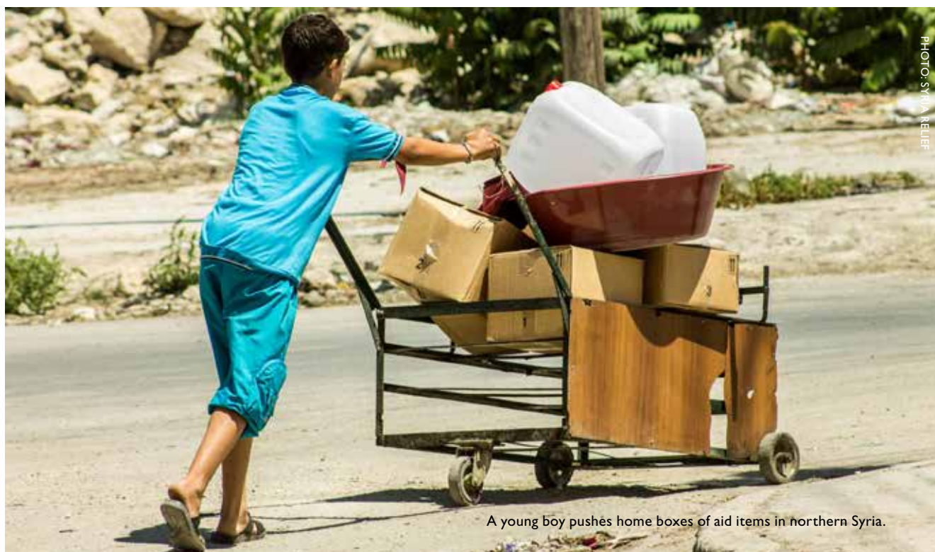
A young boy pushes home boxes of aid items in northern Syria.

represents a direct threat to children's safety while in school, it also prevents our education officers from working with communities to deliver education services and supplies and support teachers. It also limits our ability to ensure quality education is provided.