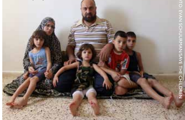
A Syrian refugee family who live in a host community in Jordan.

For various reasons, some refugees register with United Nations High Commissioner for Refugees