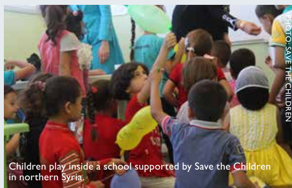
Children play inside a school supported by Save the Children in northern Syria.

In such situations, Save the Children's Education and Child Protection Service Delivery Contingency Plan kicks in. This is part of our Conflict-Sensitive Education Operating Protocols, which include guidance on community-driven education and child protection, safety, security and well-being. The Contingency Plan sets out the steps that should be taken to ensure the continuation of education and child protection under various insecure circumstances, while the Safety, Security and Wellbeing Protocol provides a series of steps that should be taken to prepare, manage and respond to incidents.