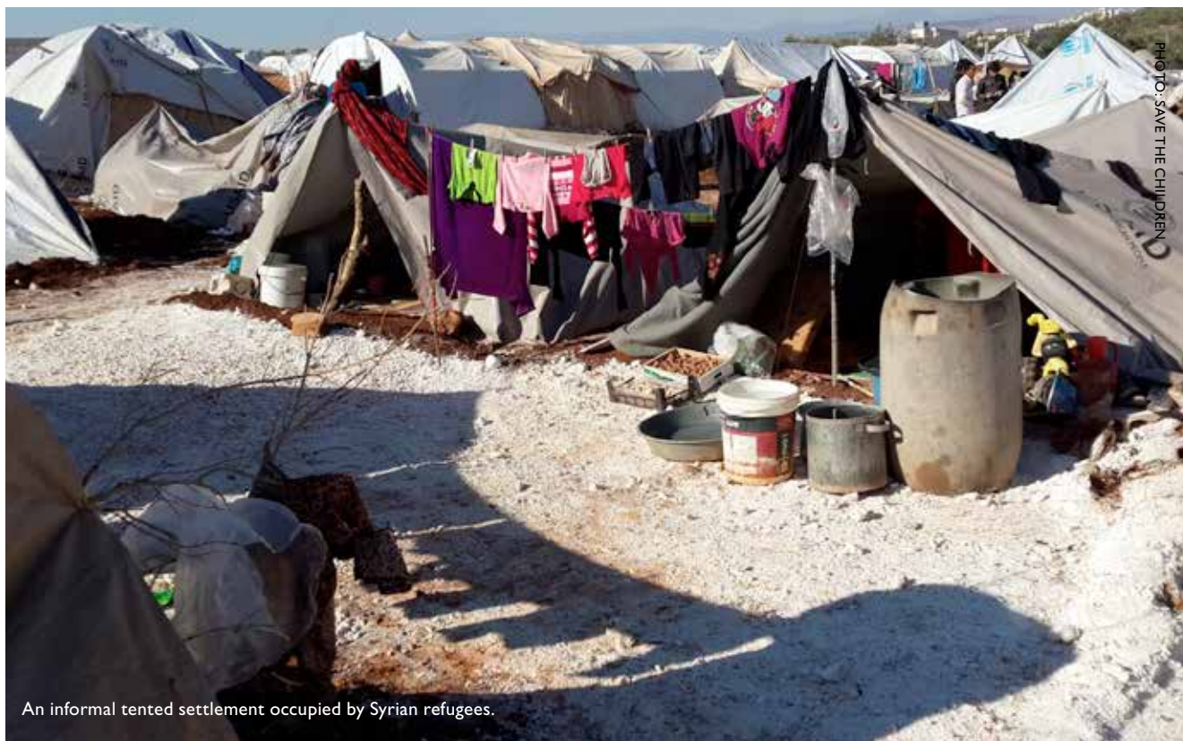
An informal tented settlement occupied by Syrian refugees.