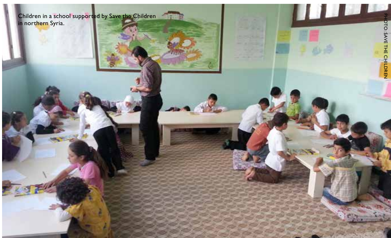
Children in a school supported by Save the Children in northern Syria.

Longer-term psychosocial distress can be minimised when teachers and communities are empowered to address issues around children's well-being in a way that also builds resilience to traumatic experiences.