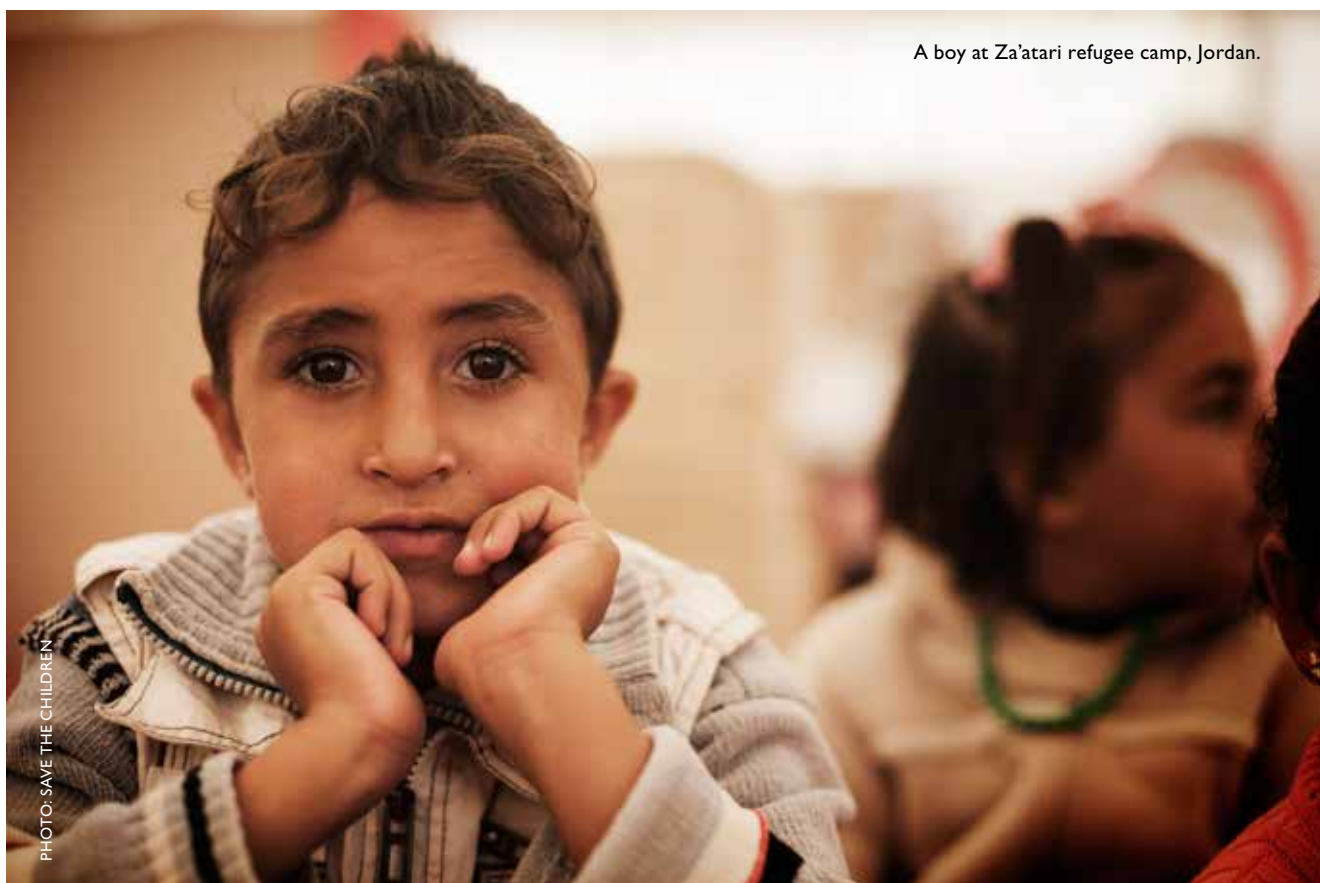
A boy at Za'atari refugee camp, Jordan.