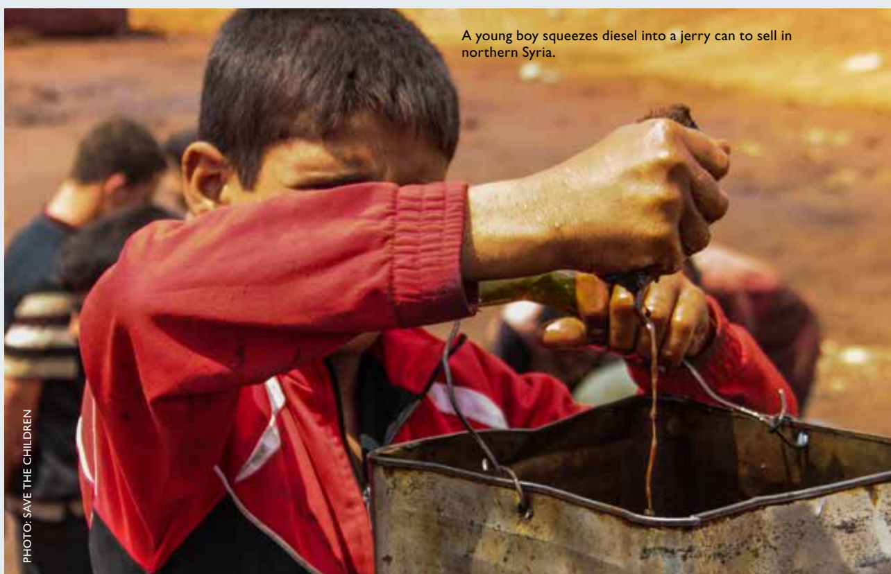
A young boy squeezes diesel into a jerry can to sell in northern Syria.

The reasons for children dropping out of school are complex and require an integrated child protection and education response by humanitarian actors. Drop-out data from Save the Children's schools reveal that, overall, equal numbers of boys and girls are dropping out of school. However, in some locations where child labour is more common noticeably higher numbers of boys are dropping out. For girls, insecurity is often a key reason for leaving education, while the prospect of early marriage looms as a solution to their families' economic and security concerns, and as a way of 'protecting' them from the risk of abuse.